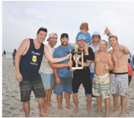
Dig These Balls - 6 Man Comp Winners