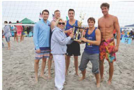
Team MJ vs LeBron - 4 Man Comp Winners