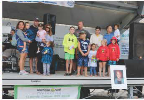
Our Kids during Opening Ceremony 2018