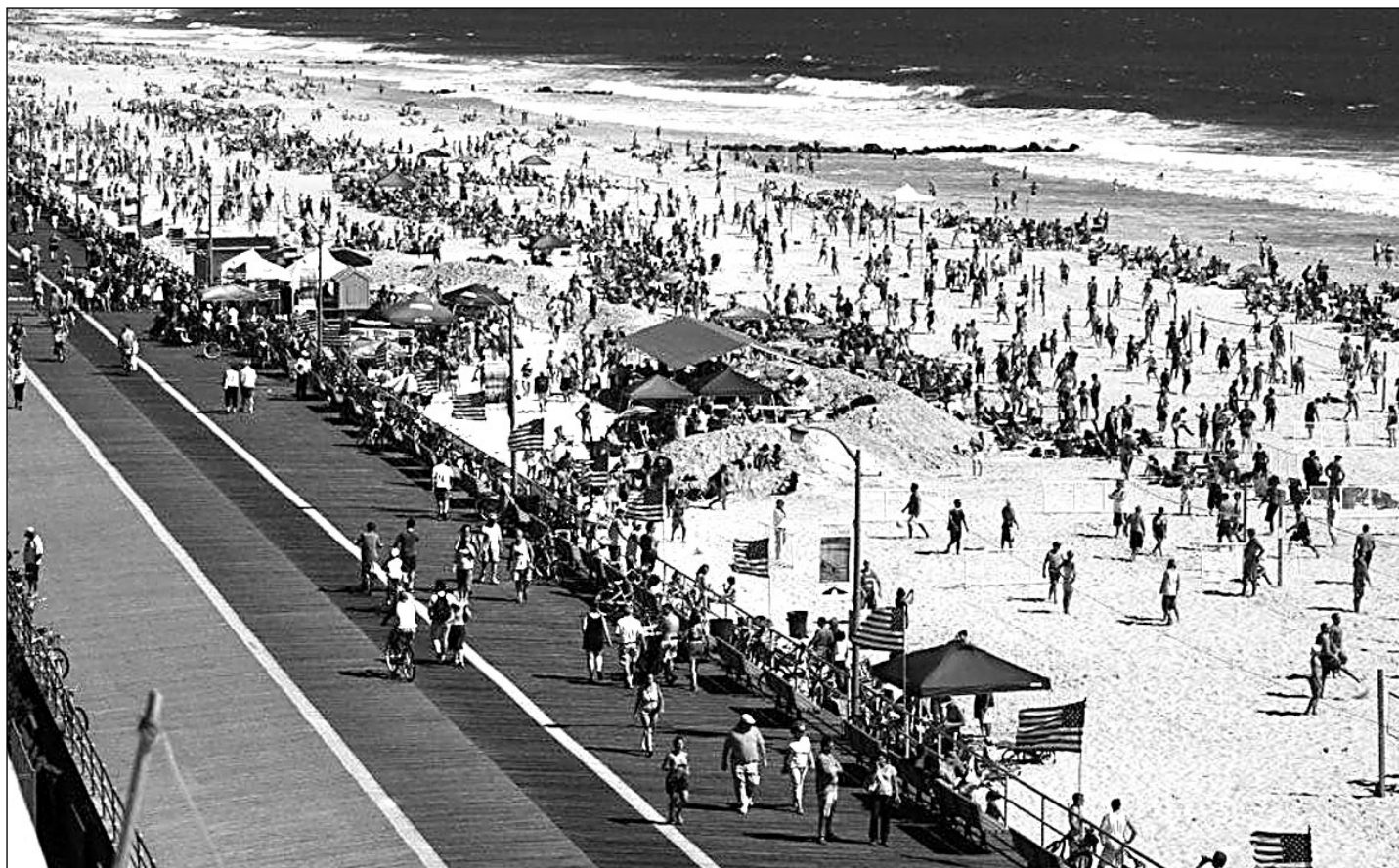
HUNDREDS PLAYED in the 12th annual Michelle O'Neill Foundation's volleyball tournament in Long Beach earlier this month, as some 278 teams competed against each other at more than 48 nets.