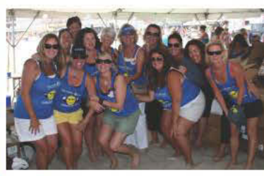
Best Committee Ever!