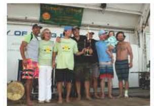
Tito's on the Rocks 6 Man Competitive Winners