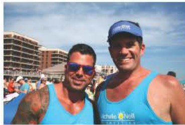
Roaming Raffle Hotties