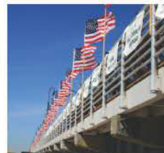
Boardwalk Flag View