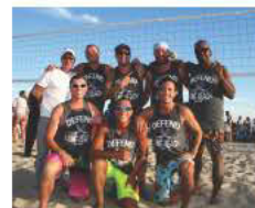
Longtrunks 4 Man Competitive Winners